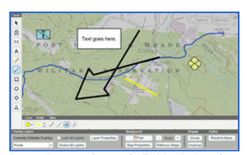
Army trainers can also use the Training Assistant's overlay map editor for training exercises. Trainees can draw and write on maps then compare them to the trainer's map.