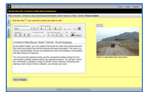
NCSA's team of researchers created a surface Web search system that lets trainers quickly find related text to insert into the software's text editor.